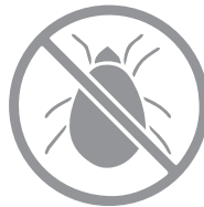
Bed Bug Management