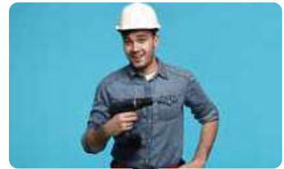
General Payroll Services